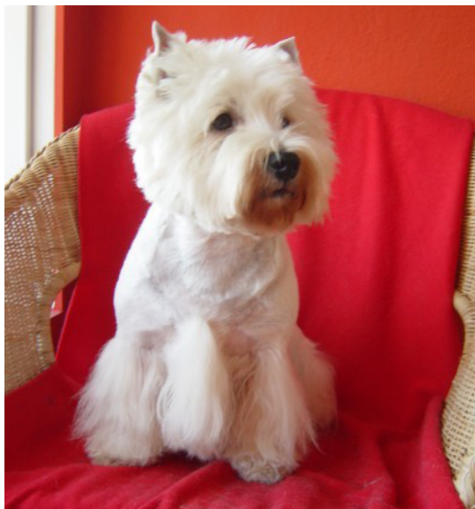
Our first West Highland White Terrier Mak.

close one very promising female from R litter. Rheia (Rheia Gregorjanska; 2016) gets her home at lovely lady we know, but she will still be part of our breeding.